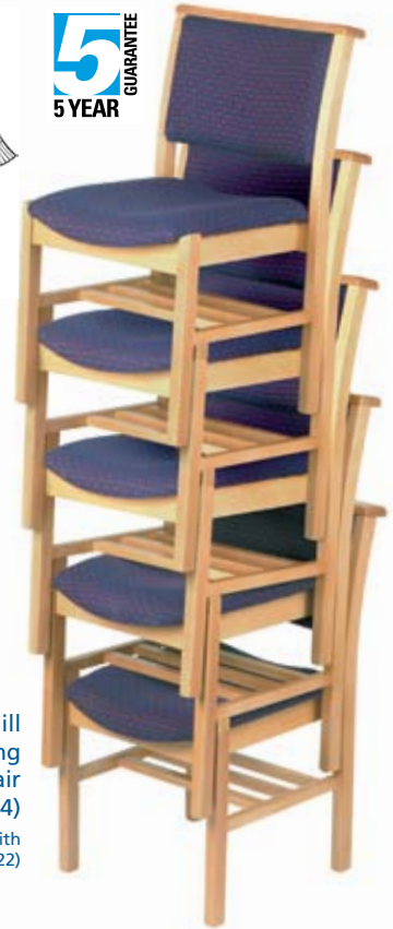
The Churchill Deluxe Stacking Church Chair (A184)

(Picture shown with Stacking Block A122)