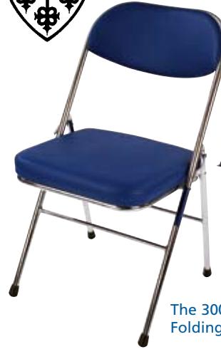
The 3000 Series Folding Chair (C533)