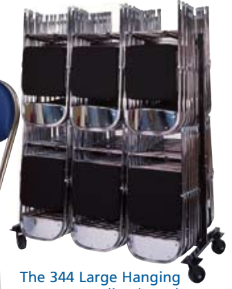
The 344 Large Hanging Trolley (H141)