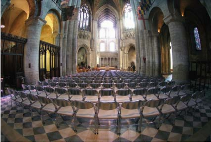
Above: 450 Rosehill 3000 Series Folding chairs installed in October 2008

Heralded as one of the most magnificent buildings in the country Ely Cathedral is a house of prayer, a unique educational resource, the Ely Diocese Mother Church and a very popular tourist attraction.