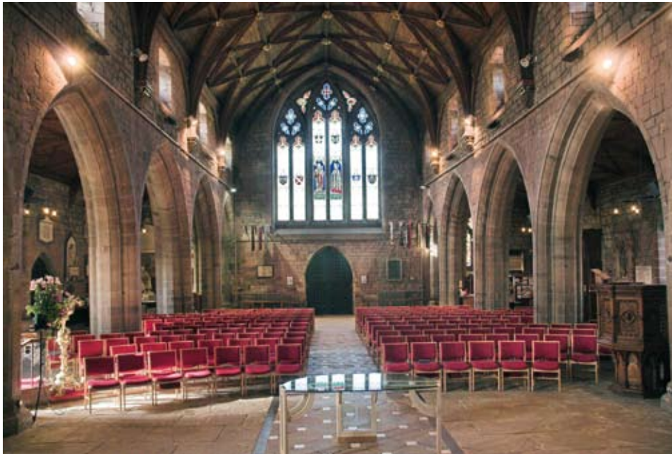
Above: 230 Churchill Deluxe stacking chairs installed in December 2003

(Picture shown with Stacking Block A122)